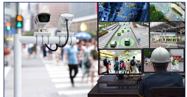
Figure 4: Multimodal data collecting using CCTV video feeds and computer vision

Leveraging existing ITS infrastructure such as CCTV cameras (video feeds) and using computer vision algorithms to process the subsequent data enables real-time object detection for different use cases, is cost effective, and is easily adaptable to other cities or states.