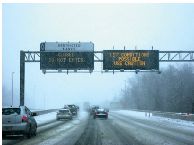
Figure 3: Weather alerts and operational conditions being communicated to drivers via DMS

Many safety and mobility applications have been deployed that rely on data collected from ITS sensors. For example, in Minnesota, a Dynamic Message Sign (DMS) displaying weather alerts based on the data collected from RWIS sensors, cameras, and friction sensors was associated with a statistically significant reduction in average speeds by 3.5 mph and 85 th percentile speeds by 2.9 mph in the eastbound direction of the US 12 corridor. Temporary traffic sensors were installed upstream and downstream of the DMS location to gather data to assess the effectiveness of DMS-based weather alerts ( 2022-B01680 ). Additionally, several states have deployed statewide Truck Parking Information and Management Systems (TPIMS) across multiple rest areas to provide real-time parking availability information to the truck drivers. Parking detection systems include